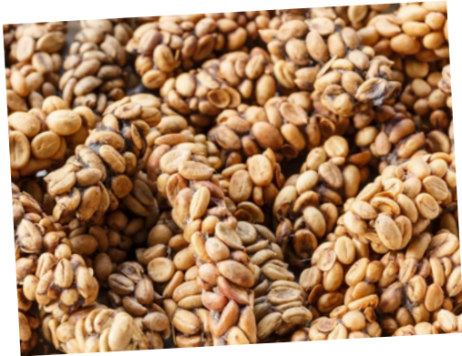
Luwak Coffee Bean

Kintamani luwak coffee (kopi luwak) is made from coffee cherries eaten by a civet ( luwak ); the beans are later collected from droppings, thoroughly cleaned, dried, and roasted. It's considered unique and expensive because it's rare, labor-intensive, and depends on a natural selection process of cherries